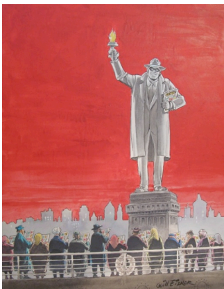
Will Eisner, The Spirit & the Immigrants , 1999-2000